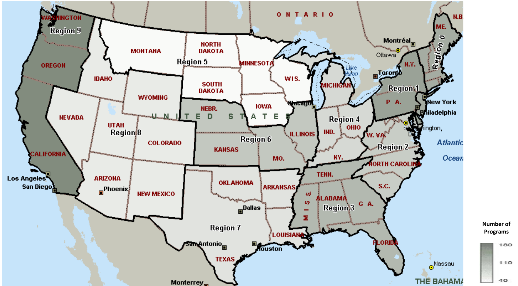
Figure A1: Number of Programs in Each Geographic Region (2003)