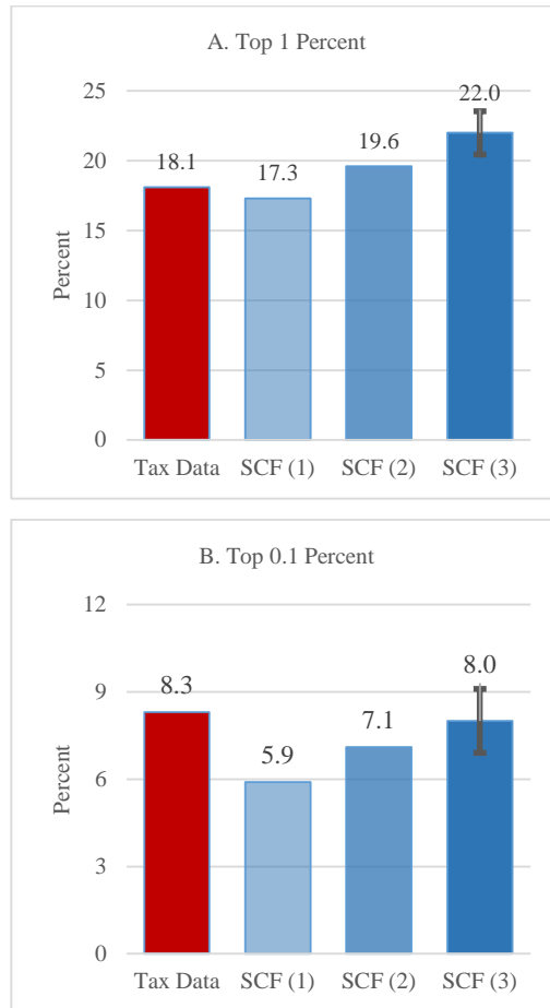
FIGURE 1. ESTIMATED SHARE OF INCOME HELD BY TOP PERCENTILES IN 2010

You may enter your figures on this page of the template. At publication, your figure must fit within the width of one column of this template (2 5/8 inches or 6.8 cm).