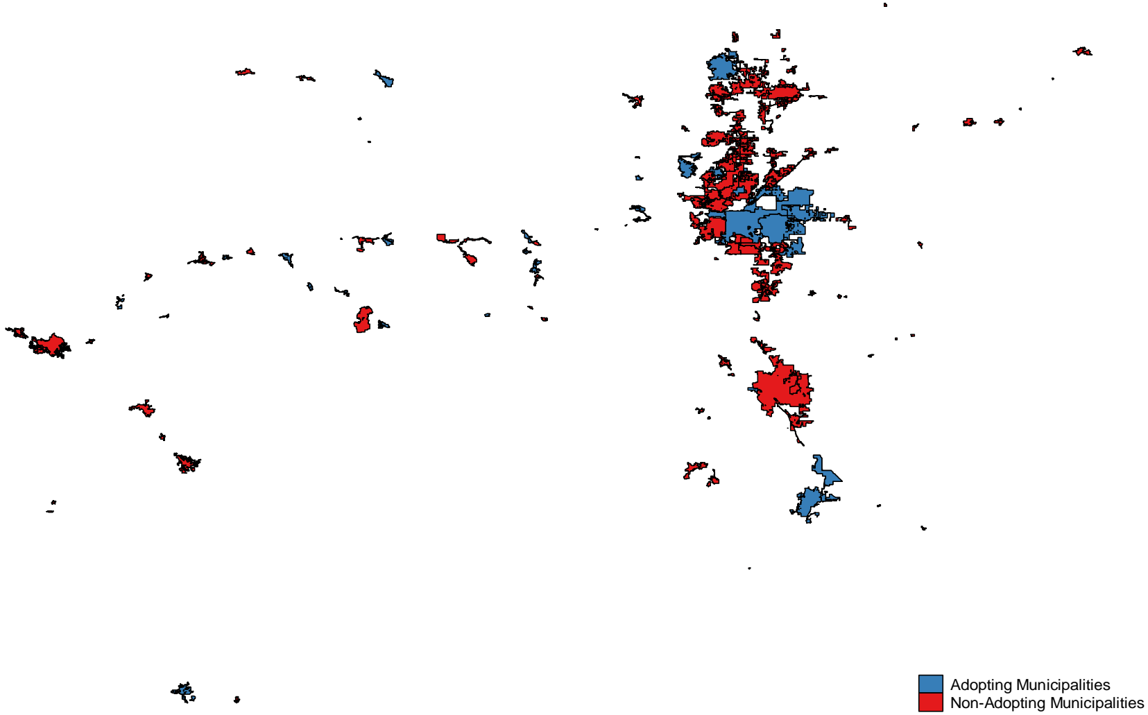
Figure 1. Map of Municipalities that Adopt Retail Marijuana Laws and Municipalities that Do Not