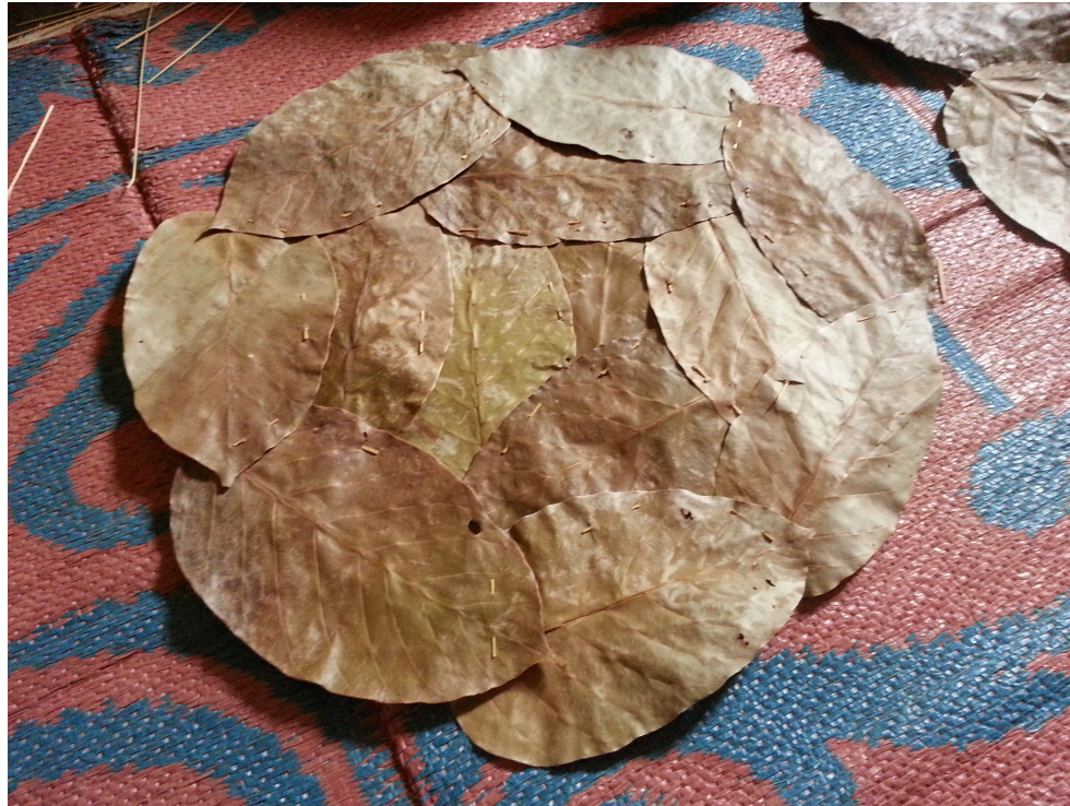
Figure 1: Leaf plate

Notes: This figure shows a sal tree leaf plate akin to the ones produced as part of the experiment. In accordance with quality standards asked for by contractors in the area, leaf plates were required to (i) meet a minimum size requirement, (ii) have no gaping holes, (iii) have all leafstalks (petioles) covered by other leaves, and (iv) have the inner center parts placed underneath the outer rings of the plates.