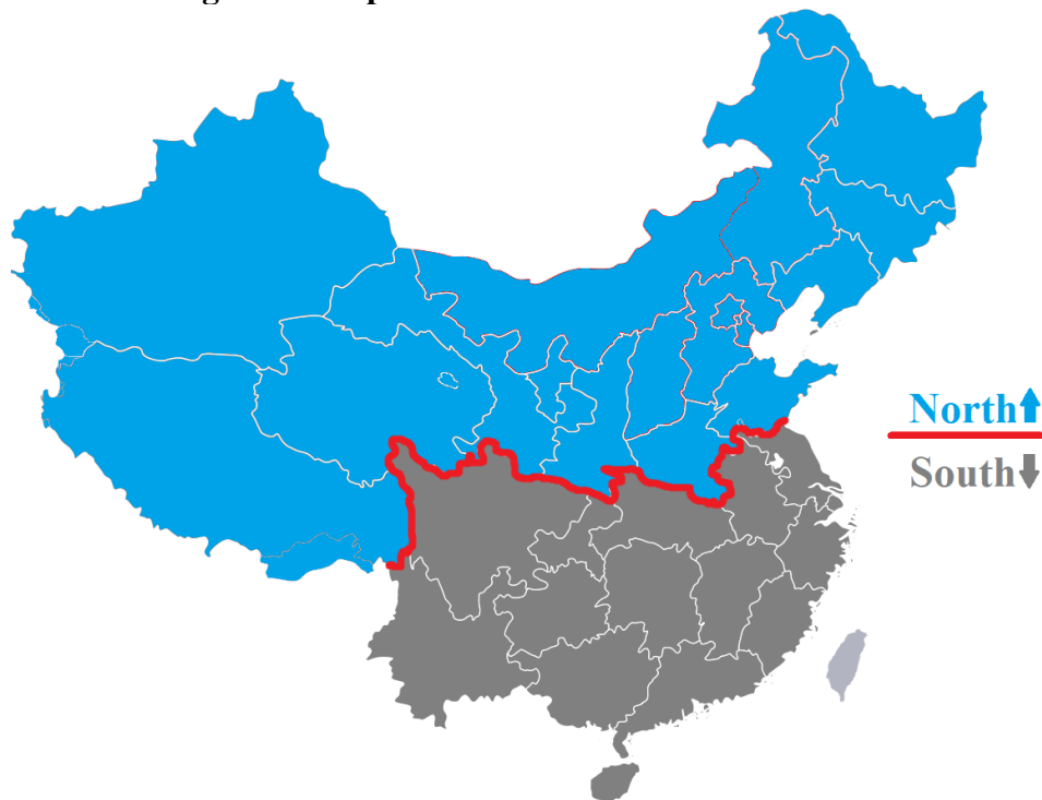
Figure 1: Map of Northern and Southern China

Subdividing the sample between northern and southern China as defined above, the regression specifications in Table 4A show that the pollution-gambling relationship holds significantly across both North and South, and that the effects are of similar magnitude, although of slightly stronger in magnitude in the North.