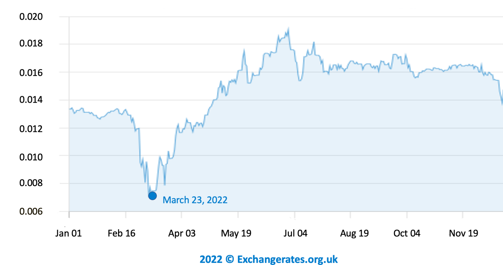
Figure 2. USD/RUB for Year 2022