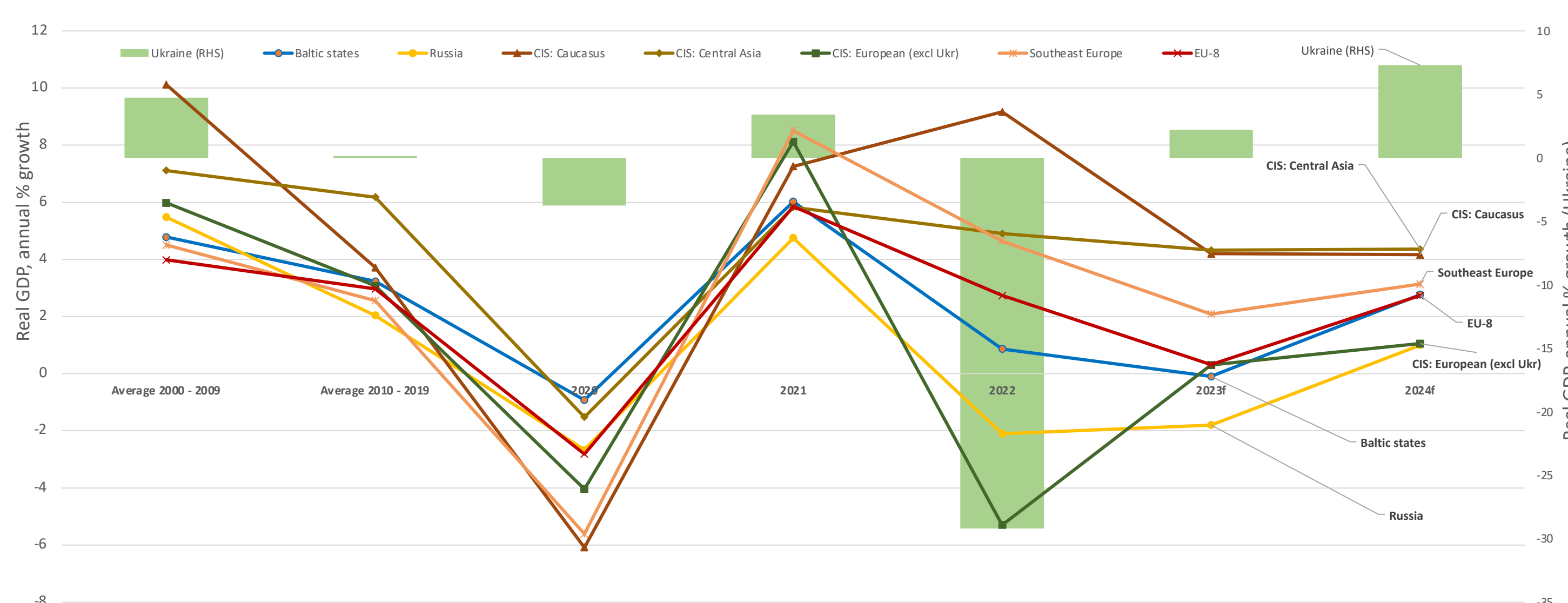
Fig 1. Annual real GDP growth, % || Source: WDI (2023) and FocusEconomics (April 2023). Note: f – forecast; due to the scale effect, data for Ukraine appear on the right hand-side.

This brief essay is an attempt to analytically review the most recent developments in the post-socialist CEE and FSU. The difficulty is to offer a commentary about real-time kaleidoscopic occurrences; a commentary that would hold relevance beyond immediate time horizon. The only true constant variable in the post-socialist region is the volatility of ground-shifting historic events. Those events often turn out to be catastrophic to the society's institutional fabric, systemic continuity, and economic development. Recently, the sad reality in the bigger part of the post-socialist realm, has been filled with precisely such type of destructive events. History's chokehold, especially on the fates of the smallest economies, seems to be inescapable.