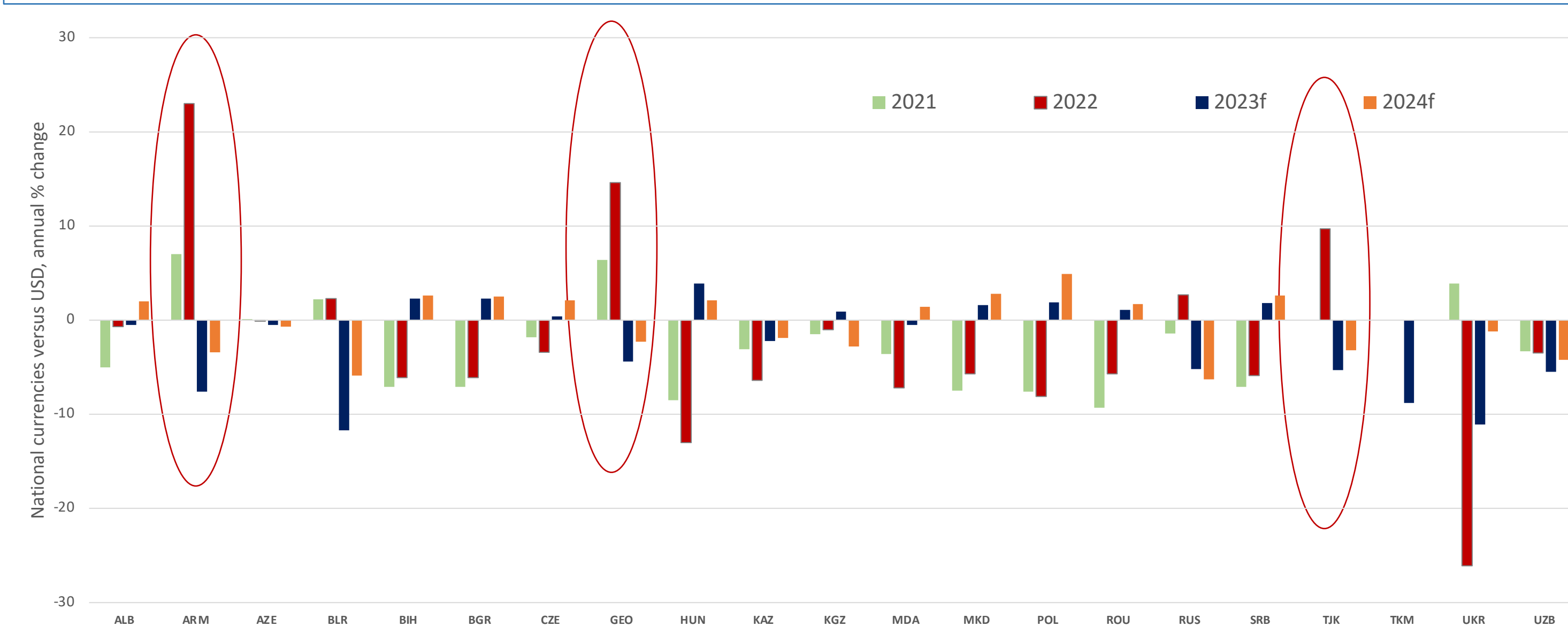
Fig 2. Exchange rate, national currencies versus USD, annual % change. f – forecast.

Drivers and RISks of FX appreciation (Fig 2): 1) Labor migrants' remittances; 2) individual relocation; 3) corporate relocation; 4) increased trade - risks in reversals .