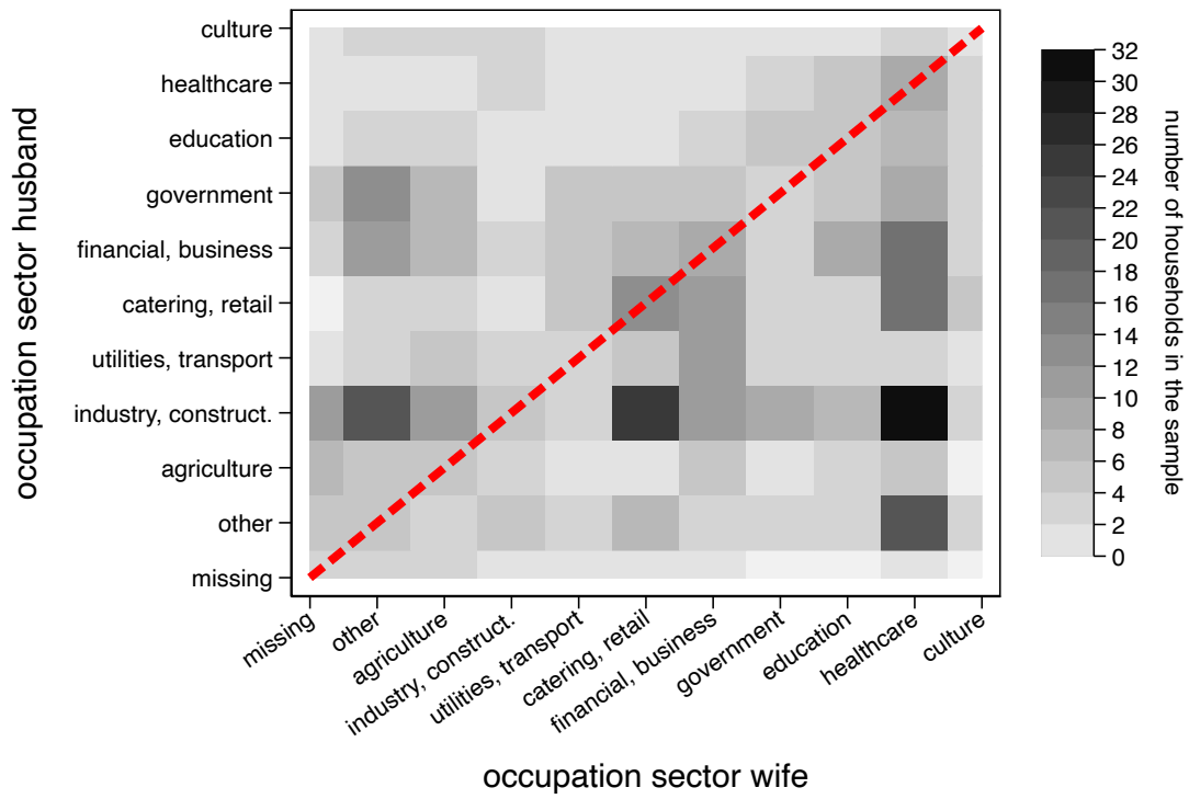
(a) Occupational sector heatmap