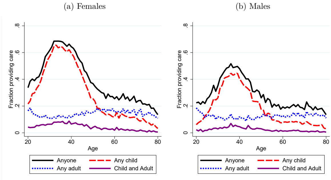
Appendix Figure 1: Caregiving over the lifecycle

Notes: Figure reports the percent of individuals at each age who provide care to a child (red long dash), an adult (blue short dash), either (black), or both (purple) in our ATUS sample, using individual weights.